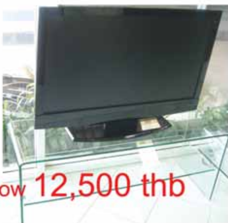
Glass tv-table 120x40x50 cm.