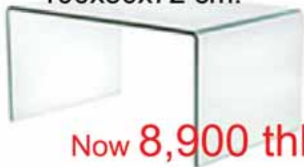
Glass office table 100x50x72 cm.