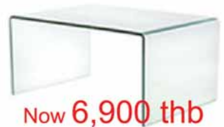
Coffee table 90x60x42 cm.